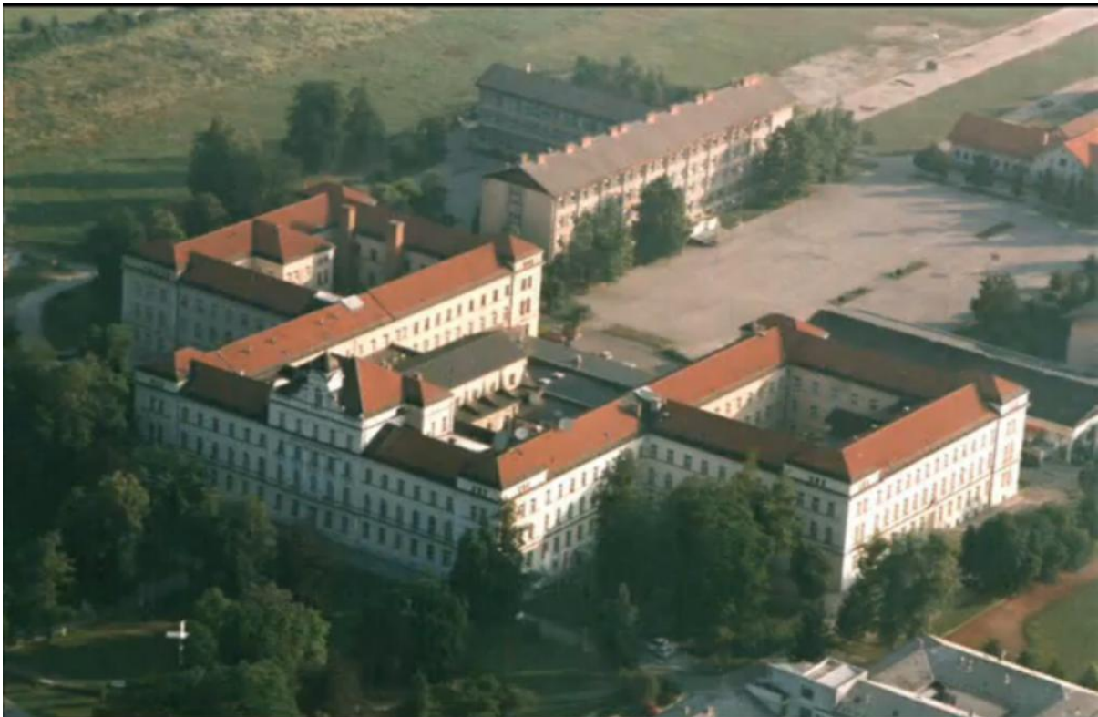
Zavod sv. Stanislava building. You will stay in the left part of the building.

You can also come a day or two earlier and leave a day or two after the course. As the kitchen is closed Saturday and Sunday you will have a special discount for additional days. The price for those days is 23 EUR per person – the same price for the first and the second person.