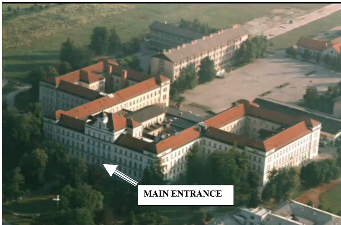
Zavod sv. Stanislava building. You will stay in the left part of the building.

You can also come a day or two earlier and leave a day or two after the course. As the kitchen is closed Saturday and Sunday you will have a special discount for additional days. The price for those days is 23 EUR per person – the same price for the first and the second person.